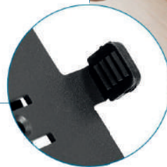
Silicon Grooved Pads